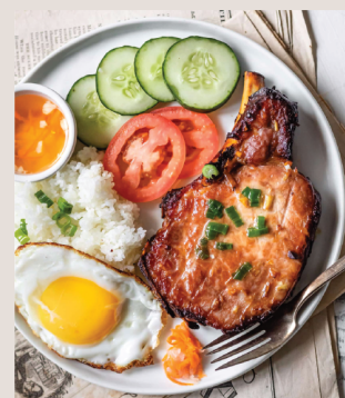
V39. Com Thit Nuong