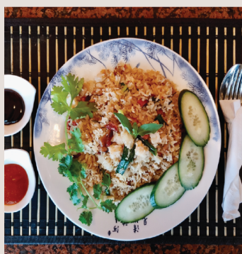
V46. House Fried Rice