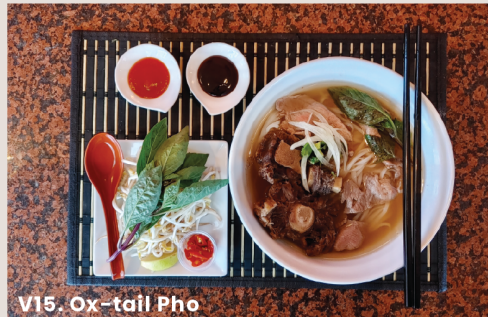
V15. Ox-tail Pho

Ox-tails are cooked for hours to meet the tenderness.