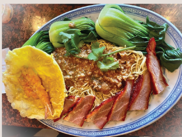
V22b. BBQ Pork Egg Noodle