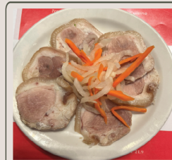
V6. Viet style hocks

Pho is eaten everyday for breakfast, lunch or dinner. A delicacy flavored, lightly scented dish that compliments its simplistic presentation with a side dish of fresh vegetables