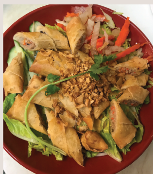
V34. Bun Cha Gio