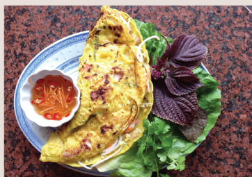
V23. Banh xeo