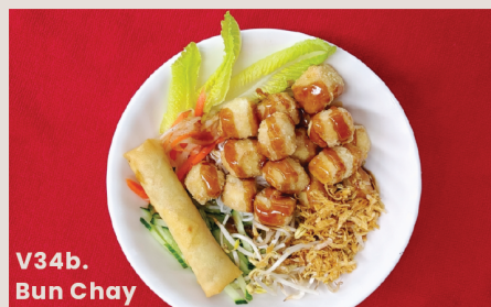
V34b. Bun Chay

OPEN 11 AM . LAST CALL DINE-IN 8:00PM . LAST CALL TAKE-OUT 8:30PM